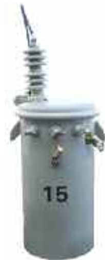
Single hanger bracket one high-voltage bushing self protected unit.