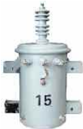
Double hanger bracket one high-voltage bushing conventional unit.