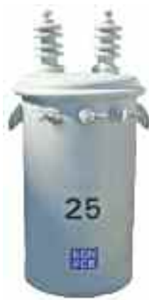
Single hanger bracket two high-voltage bushings conventional unit.