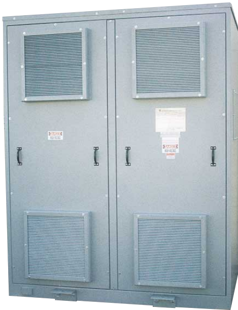
Outdoor NEMA 3R enclosure

Generally, low voltage (LV) windings less than 2,400 volts are either multi-conductor barrel or sheet conductor types. Multi-conductor windings may be more economical and preferred in smaller kVA low voltage applications in which the current and axial short circuit forces are relatively small. High voltage (HV) windings 2,400 volts or greater may be single-section barrel, multi-section barrel or disk types. Ventilated dry-type coils may be either round or rectangular through about 2,000 kVA. Transformers larger than 2,000 kVA generally are designed with round windings unless there are special considerations, such as limiting dimensions.