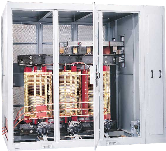
Vent Dry Transformer; standard arrangement, (HV left) with forced air cooling

GE ventilated dry-type transformers are designed for indoor or outdoor applications in schools, hospitals, industrial plants, commercial buildings and any place requiring safe and dependable power. Ventilated dry-type transformers offer an economical solution and are extremely reliable when properly installed and maintained.