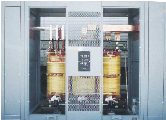
Shown with High Voltage and Low Voltage Air Terminal Compartments