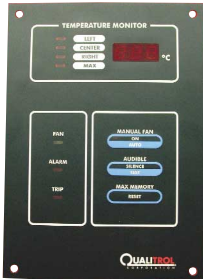
Three-Phase Temperature Monitor (Supplied monitor subject to change without notice.)