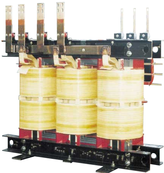
Core and Coil internal assembly

Ventilated dry-type winding designs vary depending on the voltage, basic impulse level (BIL) and current of the individual winding and/or application of the transformer. For all units, the insulation system will be 220°C regardless of the average winding rise.