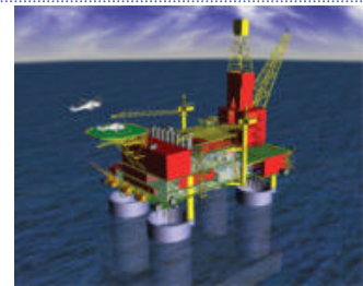
Phase 2, Lunskeye Platform