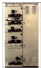
SEV panel board