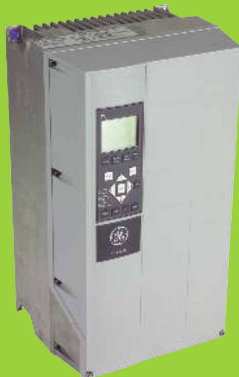
NEMA 12/IP55 shown