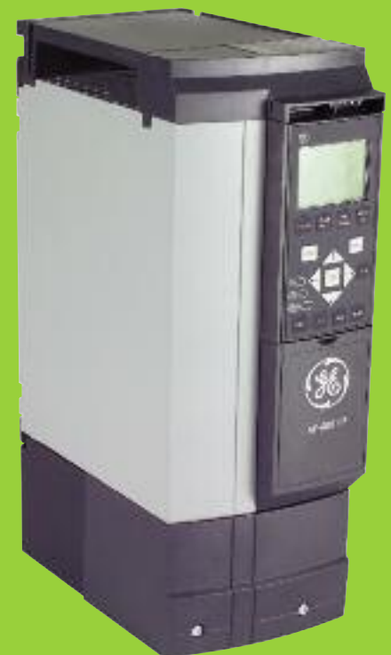
NEMA 1/IP21 shown with optional field-installed kit