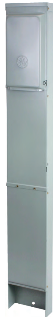
Typical Unmetered Earth Burial Pedestal

GE Energy 41 Woodford Avenue, Plainville, CT 06062 www.geelectrical.com © 2010 General Electric Company