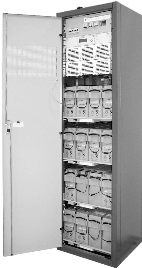
Infinity ICS4220 System with two NP2500 rectifier shelves and four battery shelves

Depending on the chosen configuration that better fits your power requirements, the Infinity system can operate either with the Galaxy Vector controller or the Spring controller. The controller serves as the single interface point for rectifier control, alarm and status reporting, battery management and plant diagnostic.